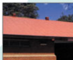
Roseville Primary School

Successfully removing the heat from over 200 Australian schools