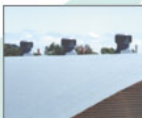
Cordeaux Heights Public School