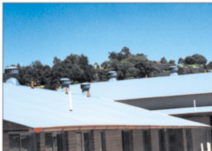
CORDEAUX HEIGHTS PUBLIC SCHOOL, SYDNEY NSW. Featuring H400 Hurricanes.