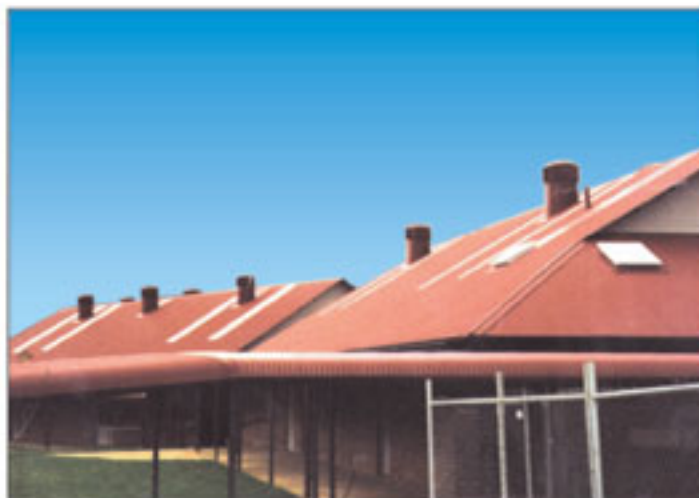
TERRA SANCTA COLLEGE, SYDNEY NSW. Featuring H700 and H900 Hurricanes.