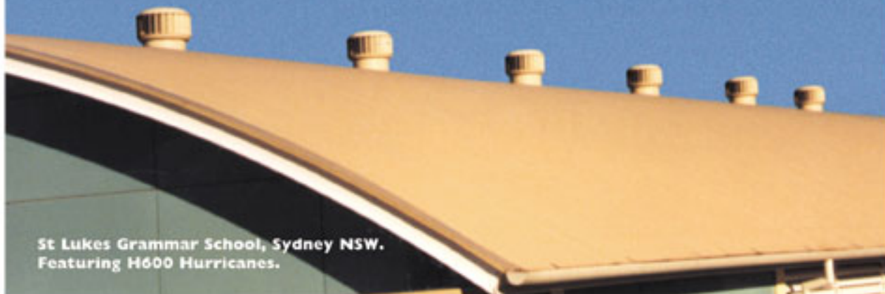
St Lukes Grammar School, Sydney NSW. Featuring H600 Hurricanes.

Despite the scientifically proven benefits of natural ventilation, many buildings do not have adequate fresh air exchange facilities in place. Stale and hot air will not disperse by itself. Opening doors and windows is simply not sufficient to create air flow. Air must be purposely removed and replaced by fresh, ambient air.