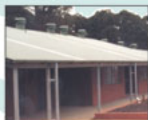
Cranebrook Public School